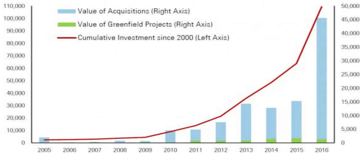
Figure 1: Chinese FDI Transactions in the US, 2005-2016* USD million

Source: Rhodium Group. *Data are preliminary and subject to adjustment. A detailed explanation of sources and methodology can be found at http://rhg.com/interactive/china-investment-monitor